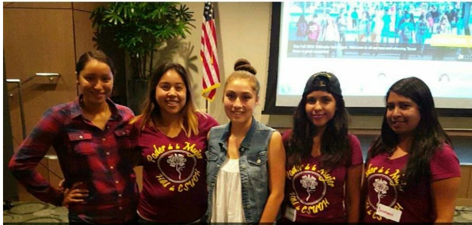
Some Hermanas during Tabling